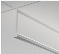
Indirect UpGlow Lens