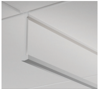
Indirect Flat Diffusing Lens