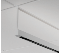
Indirect Flat Diffusing Lens Direct Black Multi-Reflector