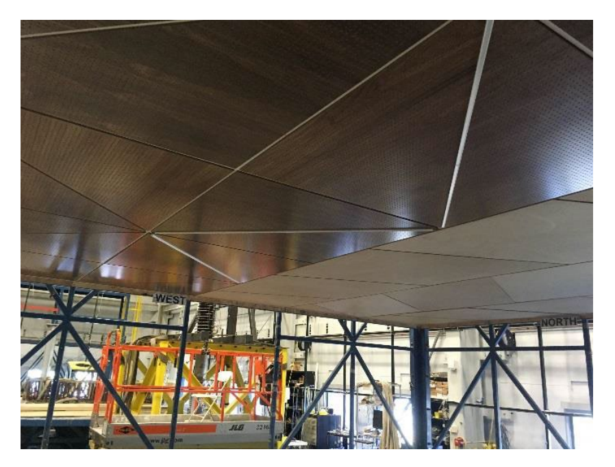
Figure 2 - Custom cross tee lights (system 18B)

Table 1 presents summary information on the components of the ceiling system.