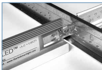
Armstrong® X-LED mounting clip with T-BAR LED®

Installation is simple with no manipulation of the ceiling tiles or grid.